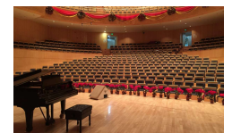
Performing Arts Center

(5) Carolina Performing Arts Center A core group of performing artists and entertainment companies are uniting their efforts to build a state of the art Performing Arts Center and Arts Network that serves each of their specific needs to start, sustain and grow their art, program or business.