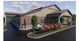
Longs Community Center

(1) Longs Community Development Center is currently in full-swing. Land, office and programming space has been acquired. Several funding sources are in progress, the board of directors and committees are now opened to the community. The Media Arts and Business Center is now serving the community.