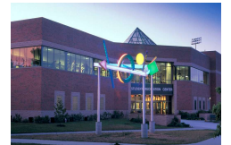
Wellspring Community Ctr

(2) Wellspring Empowerment Center Currently seeking land and inviting the residents on the South Strand to join the planning committees. The Carolina Media Arts & Business Center and The B2B Networking Sessions are currently operated from the Wellspring Fellowship Center.