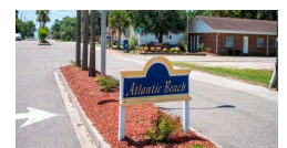
Atlantic Beach Development

(6) Atlantic Beach Development Project Designed to unite the residents, the rental property owners and the business community. This new funding and communication source will visually enhance the community and will cause sustained long-term economic growth while drawing the twenty million tourists visiting the Grand Strand (each year) to visit Atlantic Beach.