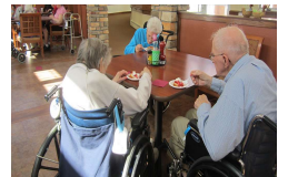
Senior Care Network

(3) Senior Care Network Families, care-providers and seniors join forces to establish the Senior Care Network to ensure every senior and care-giver has access to the specific services needed. Four homes in the Conway area been identified and are currently being sought-after for the first Soar Senior Home community that will house twelve seniors.